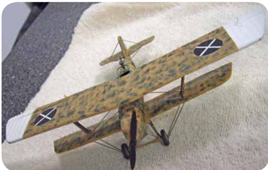
1/72 scale multimedia short-run model by Hitkit. Built by Terry Eastman